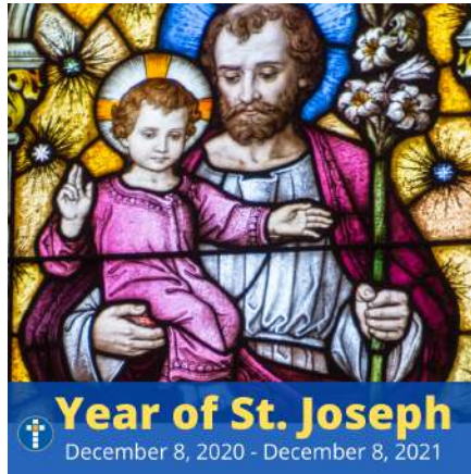
St. Joseph Feast Day March 19