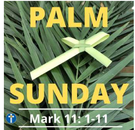
Palm Sunday March 28

50 E. Robinson St., Orlando, FL 32801 P.O. Box 4905 Orlando, Florida 32802 Tel: 407.246.4889