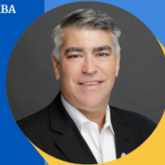
President and Chief Investment Officer Trivergent Trust Company, Winter Park Parishioner at St. James Cathedral

"...this was an opportunity to bring together my faith and my work for a greater good."