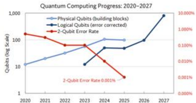
Sources: Public Announcements from Quantinuum, IONQ, Microsoft & Google

The summary of that awareness is that we are living in an era of remarkable technological innovation that can potentially grow the economy and boost business profits, improve health outcomes, advance scientific progress, and raise living standards. The timing of awareness is also important because, like where AI was five years ago, gains are largest for investors who are positioned before the innovation is apparent to everyone.